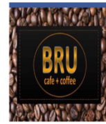
Afternoon Tea by Bru, Crewe.