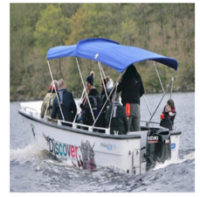
Wheely Boat, easier boarding

Please let us know if you would like to attend this lovely day trip out. We have 2 dates so please let your Lead Volunteer know which one you would like to attend. Places are limited.