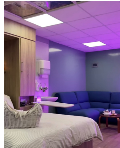
The comforting Penny Suite, with walled bed, corner sofa and kitchenette allowing families uninterrupted time with their baby.