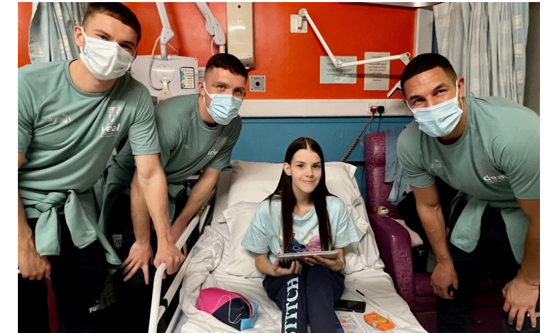
Albion players embarked on a Christmas mission to bring festive cheer to the children's ward at Sandwell General Hospital.